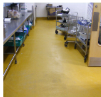
Polyurethane Screed Installation Commercial Kitchen