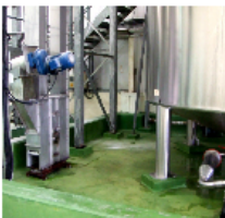
Polyurethane Screed Installation (showing rendered kerb detail) Citric Acid Bund