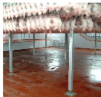
Polyurethane Screed Installation Poultry Process Factory